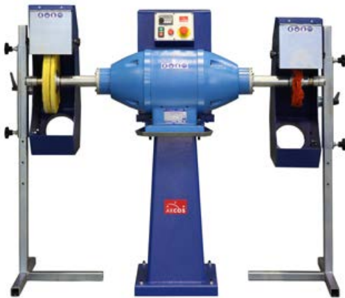
P1 POLISHING MACHINE