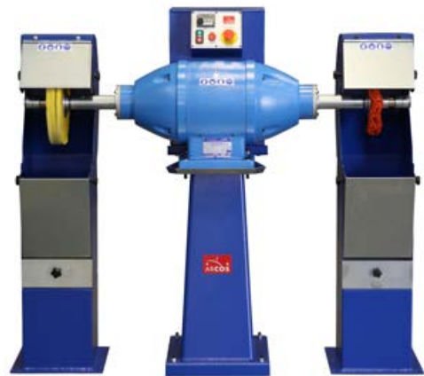
P2 POLISHING MACHINE