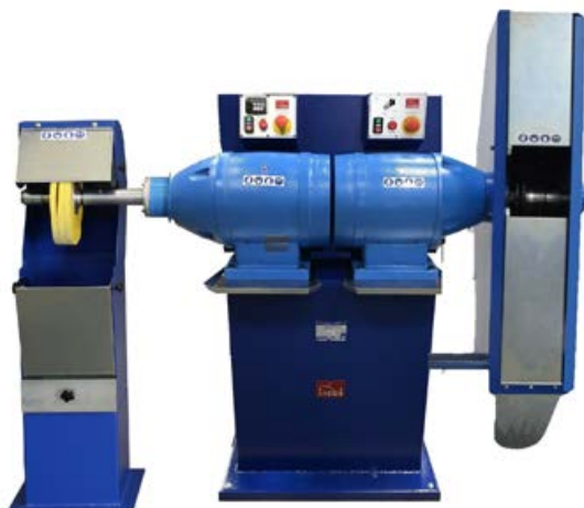
2TSA TWO HEADS POLISHING MACHINE WITH DOUBLE SPEED VARIATOR