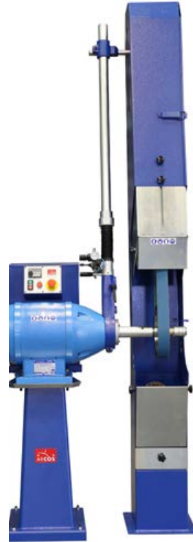
1TS/D BELT GRINDING MACHINE