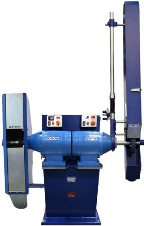
2TSC TWO HEADS BELT GRINDING + POLISHING MACHINE WITH DOUBLE SPEED VARIATOR