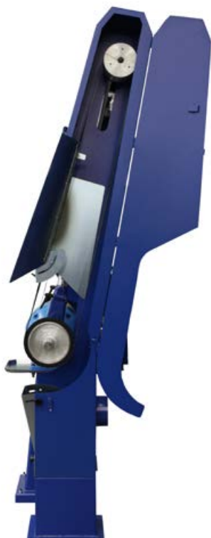
BT50 PROTECTION GUARD FOR BELT GRINDING MACHINES