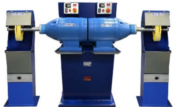
2TD TWO HEADS POLISHING MACHINE