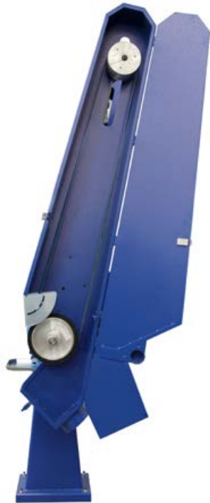
BT49RIB PROTECTION GUARD FOR BELT GRINDING MACHINES