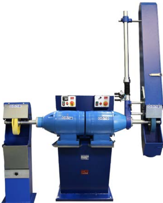
2T/A BELT GRINDING +POLISHING MACHINE