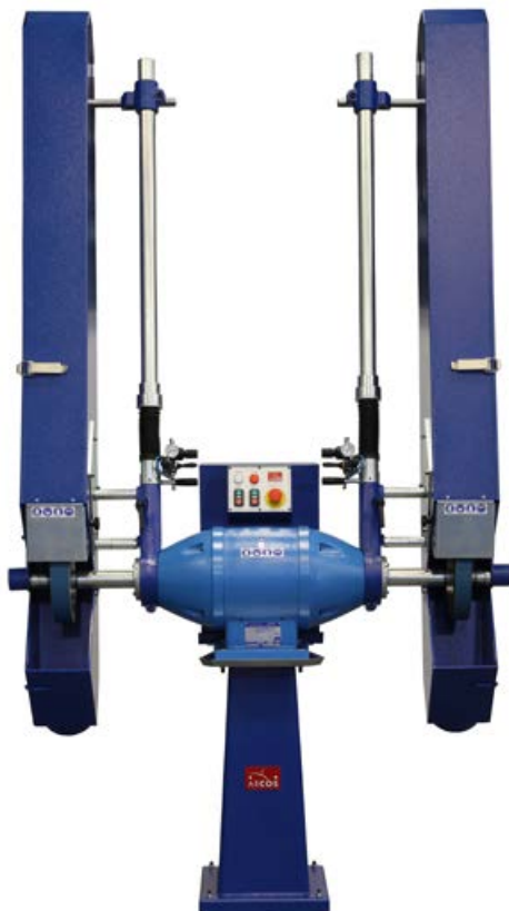
S1 BELT GRINDING MACHINE