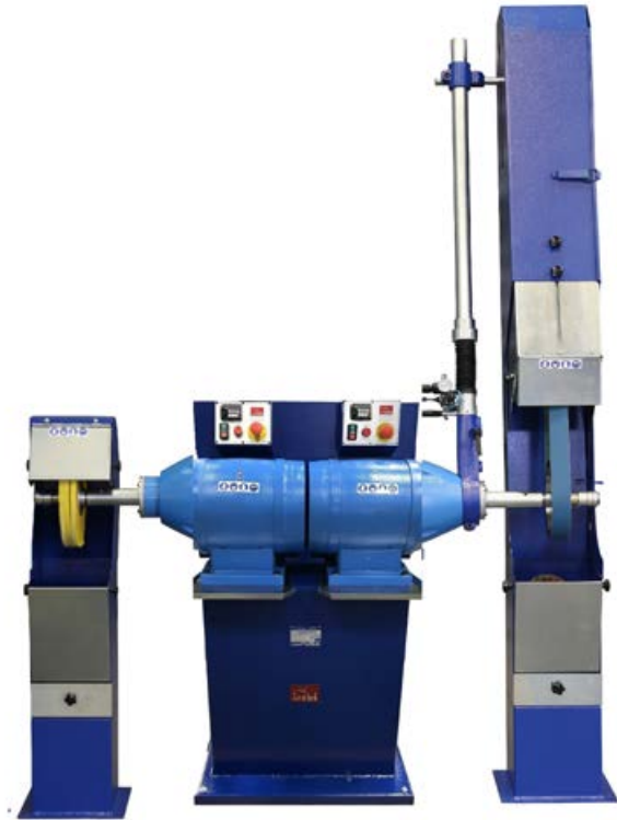
GC LARGE TWO HEADS BELT GRINDING MACHINE FOR FINISHING TURBINE BLADES