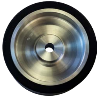
GROOVED VULKOLLAN WHEEL