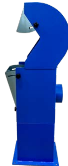
BP42 PROTECTION GUARD FOR BRUSHES DIAM MAX SPAZZOLE DIAM MAX mm 400