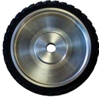
SOLID RUBBER WHEEL