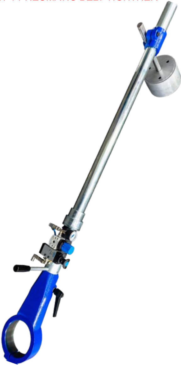
TP1 PNEUMATIC BELT TIGHTNER