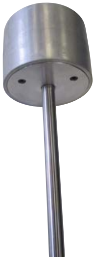
BT52 RETURN ROLLER