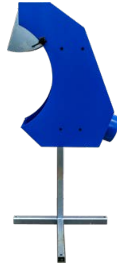
BP42 PROTECTION GUARD FOR BRUSHES DIAM MAX SPAZZOLE DIAM MAX mm 400