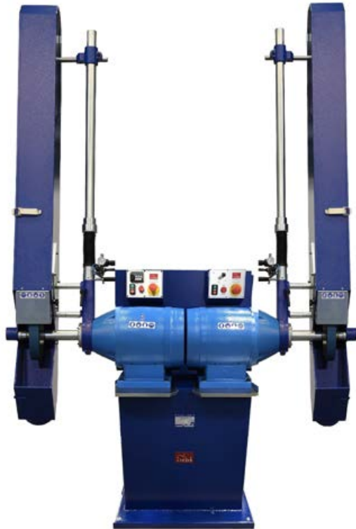
2TC TWO HEADS BELT GRINDING MACHINE