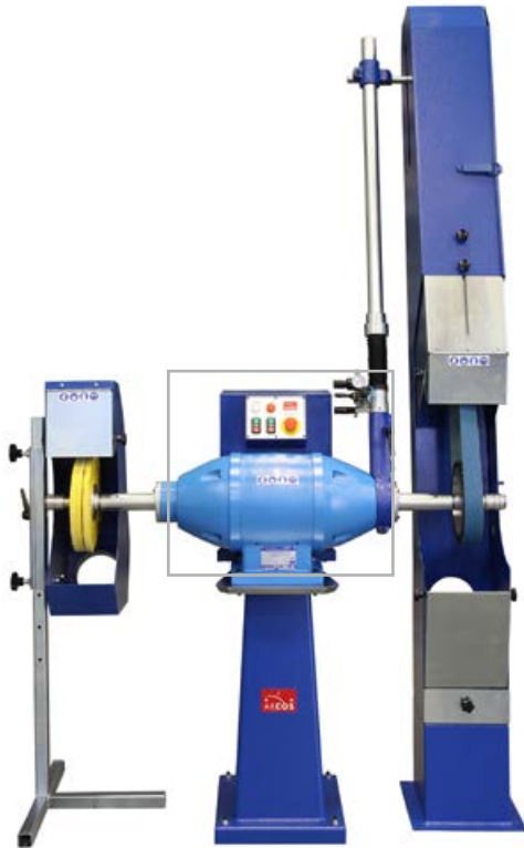
SC1/B BELT GRINDING+POLISHING MACHINE